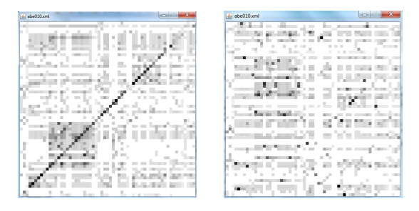
Figure 1: Cross-recurrence plot from a dialogue in the Abe corpus (age 2;5.26) showing recurrence of lexeme unigrams. Original dialogue (left) and its shuffled version (right).

Finally, a recurrence plot also allows us to investigate whether the observed recurrence has a directionality. For instance, if the adult adapts to the child more than the child does to the adult, we would expect to find more recurrence in pairs of turns where the child's turn temporally precedes the caregiver's turn. And vice versa if it is mostly the child's speech that resembles earlier speech by the adult. The information encoded in the plot can easily be exploited to capture these notions. Since the child's turns are always located on the y axis of the plot, the subset of recurrence points in D where j > i (located in the upper half of the plot, above the diagonal line of incidence) correspond to pairs of turns where the child speaks after the adult, while the opposite is the case for the